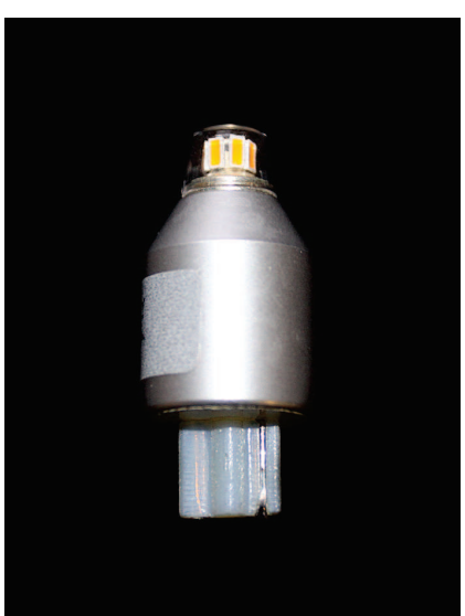
(Shown with T-5 Wedge Adapter. Included with every Bipin.)

Specifications subject to change without notice.