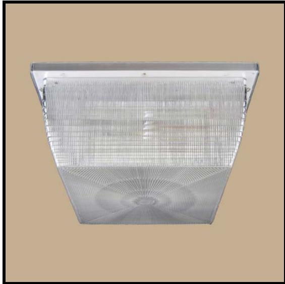
Compact Fluorescent Square Fixture 200 Series

LEADING THE INDUSTRY WITH QUALITY YOU CAN DEPEND ON