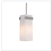
488111BN Brushed Nickel