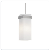
498111BN Brushed Nickel