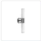
60882BN Brushed Nickel