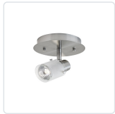
81351BN Brushed Nickel