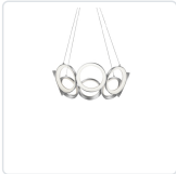
CH94824-AS Antique Silver