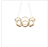
CH94824-AN Antique Brass

Die-cast aluminum rings with translucent acrylic diffusers. Metallic brushed or matte powder-coat finish. Outward emitting light. Custom options available.