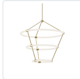
CH99326-NB Natural Brass