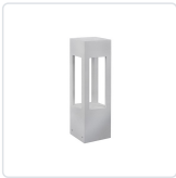
EB2924-BN Brushed Nickel