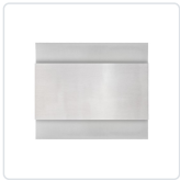
EW6108-BN Brushed Nickel

Smooth, modern; Tucson is rated for exterior use and is absolutely perfect for indoor use as well. A die-cast aluminum rectangle is attached to the front of the square, die-cast aluminum, flush mounting plate. The LED light source is concealed behind the rectangle to direct the viewer's attention to the absence of light around the glow of LED light. Uplight and downlight emanate from the 2 sides of the rectangle. Choose from black, brushed nickel, or white finish.