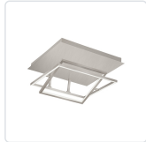
FM16126-BN Brushed Nickel