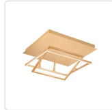
FM16126-SG Soft Gold