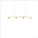
LP19937-BB Brushed Brass