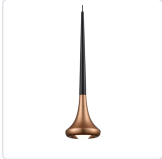
PD19601-BK/VB Black/Vintage Brass