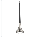
PD19601-BK/BN Black/Brushed Nickel