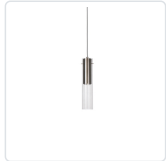
PD21703-BN Brushed Nickel