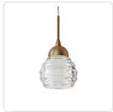
PD54504-VB Vintage Brass

Classic but modern LED single downward pendant, with polished chrome metal details and elegant cannikin which omits the light beautifully through billowing heavy gauged die-cast clear glass. Equipped with our powerful 120V AC LED technology. Similar styled chandeliers, pendants, walls sconces and vanities available. See series for full family details.