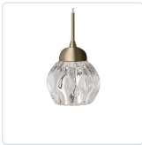
PD56205-VB Vintage Brass