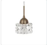
PD56404-VB Vintage Brass

Single and multi-pendants available in three different glass shapes, the possibilities are endless. You can choose between tulip, malt and lantern to compliment your space. The glass diffuses the light to enhance the warmth in your room.