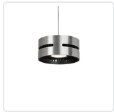
PD6705-BN Brushed Nickel

Single LED pendant with heavy gauged cast aluminum outer casting, visible black heatsink from two decorative openings around the outer casing and from the bottom of the pendant. 45 degree integrated reflector. Available metal finishes in brushed nickel white and black. 120V AC LED technology,