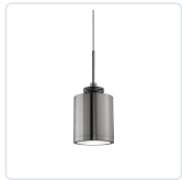
PD8204-BN Brushed Nickel