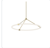
PD99126-NB Natural Brass