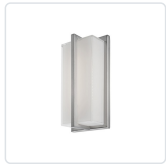
WS2412-BN Brushed Nickel