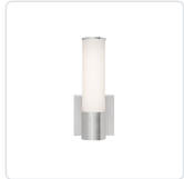
WS60111-BN Brushed Nickel