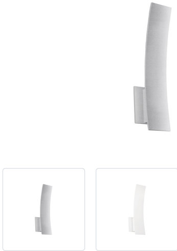
WS8016-BN Brushed Nickel

Architectural designed modernized cast metal wall sconce is available in a high-end brushed nickel or white finish. From the base of the fixture the extended arm arches away from the wall which provides a wider span of light to reflect away from the fixture to the surrounding area. Provided with our powerful 120V AC LED technology.