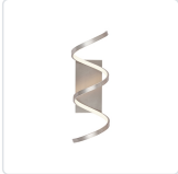
WS93724-AS Antique Silver