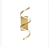
WS93724-AN Antique Brass

A looping radiant line casts light across space in a continuous helical path. The Synergy series is characterized by the rolled rectangular extrusion, which emits soft light through the silicon opal lens. Configured in both linear and ring arrangements, the arcing aluminum allows the curated finishes to be visible at every angle.