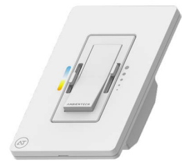
Tunable White Wall Switch Included