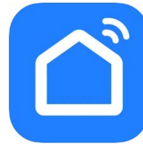
Smart Life App for Tunable White available on iOS and Android