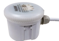
MS - Motion Sensor (Optional)

Alcon Lighting 15210 LED Linear High Bay